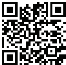
YouTube Pieces to Treasure